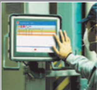
riteTIME on a touchscreen

Engineers or designers typically work at a desktop PC. With riteTIME loaded on their desktop PC, engineers and designers can track the work they do on jobs and work orders without leaving their work area.